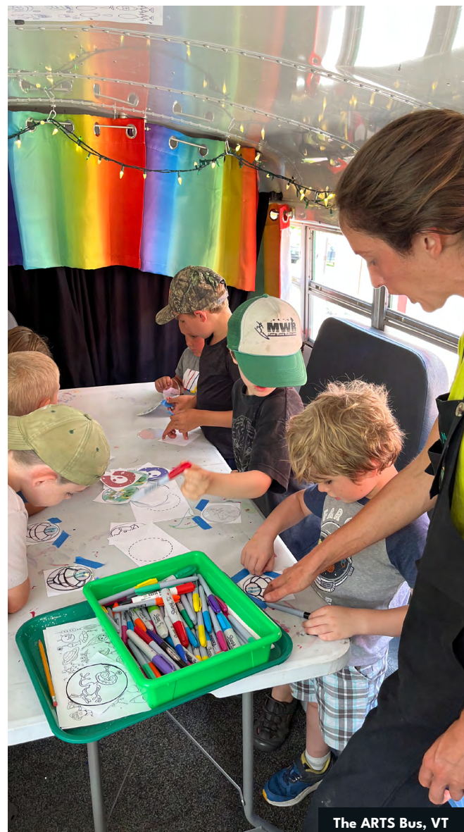
The ARTS Bus, VT