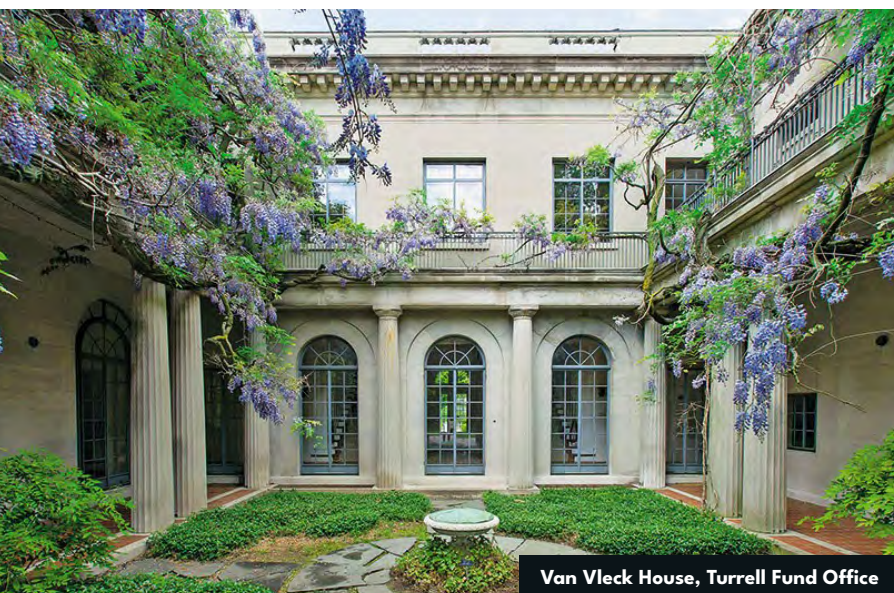
Van Vleck House, Turrell Fund Office