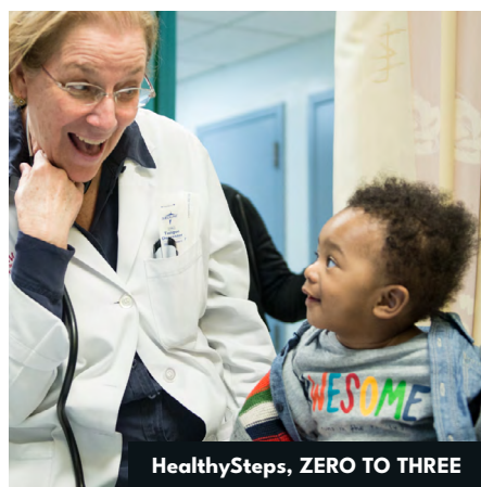
HealthySteps, ZERO TO THREE