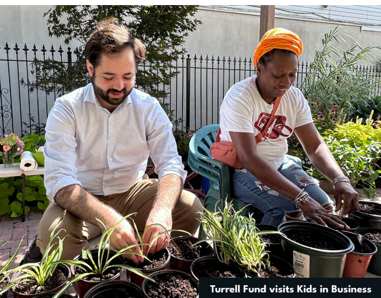
Turrell Fund visits Kids in Business

Interested parties are encouraged to contact Turrell Fund at turrell@turrellfund.org .