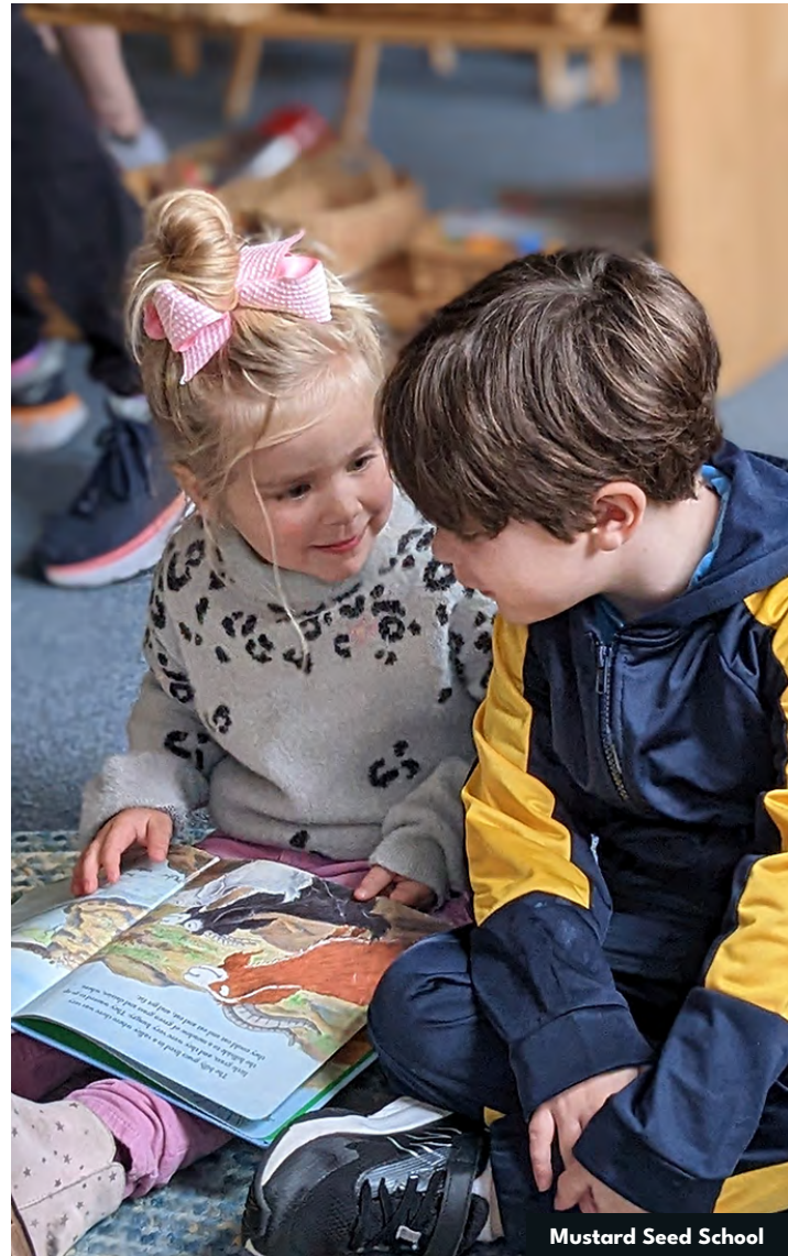
Mustard Seed School