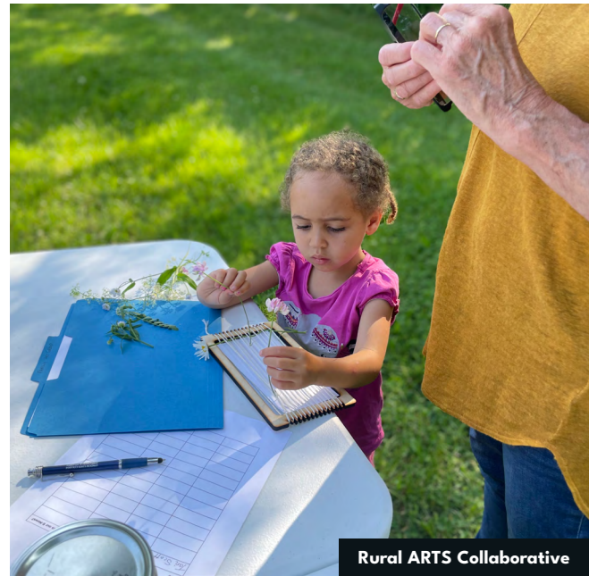
Rural ARTS Collaborative

For a complete list of S. Whitney Landon Award recipients, please visit our website at www.turrellfund.org .