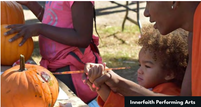
Innerfaith Performing Arts