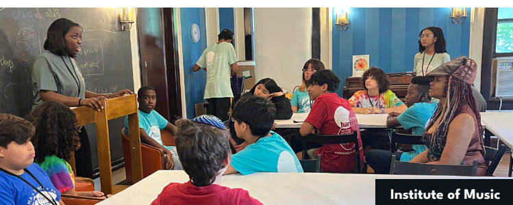
Institute of Music